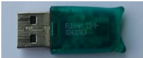
Figure 7-1: HASPHL