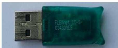
Figure 7-1: HASPHL