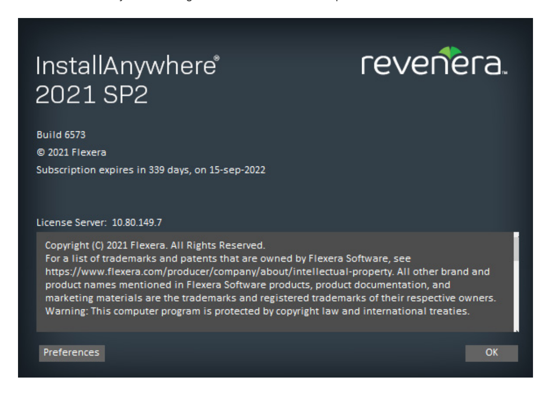
Note - This has been tracked by WO IOJ-2216467.

The About InstallAnywhere dialog box for Concurrent subscription license: